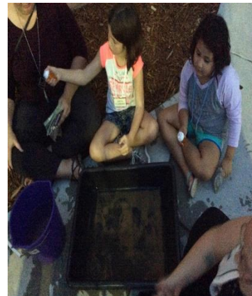
Topeka Junior Rockhounds panning for gold and other gems